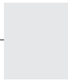
VACANT Council & Board Liaison